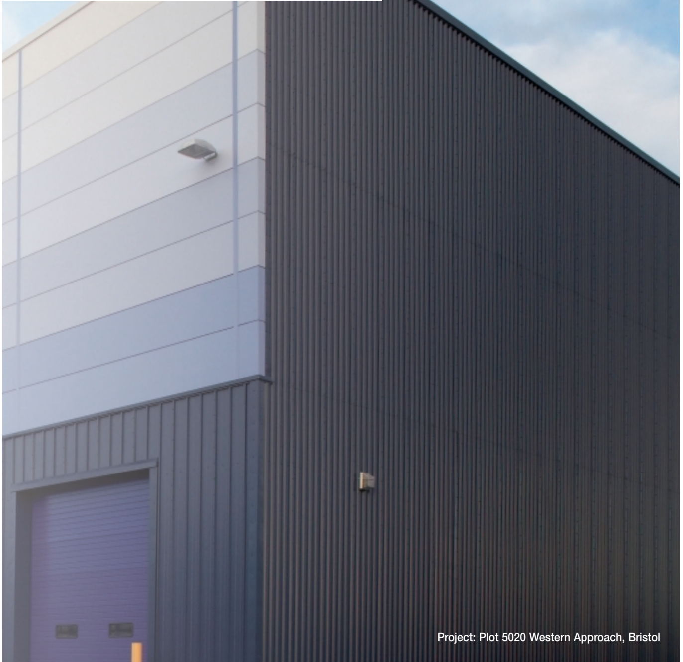
Project: Plot 5020 Western Approach, Bristol

A simple, intelligent solar air heating system